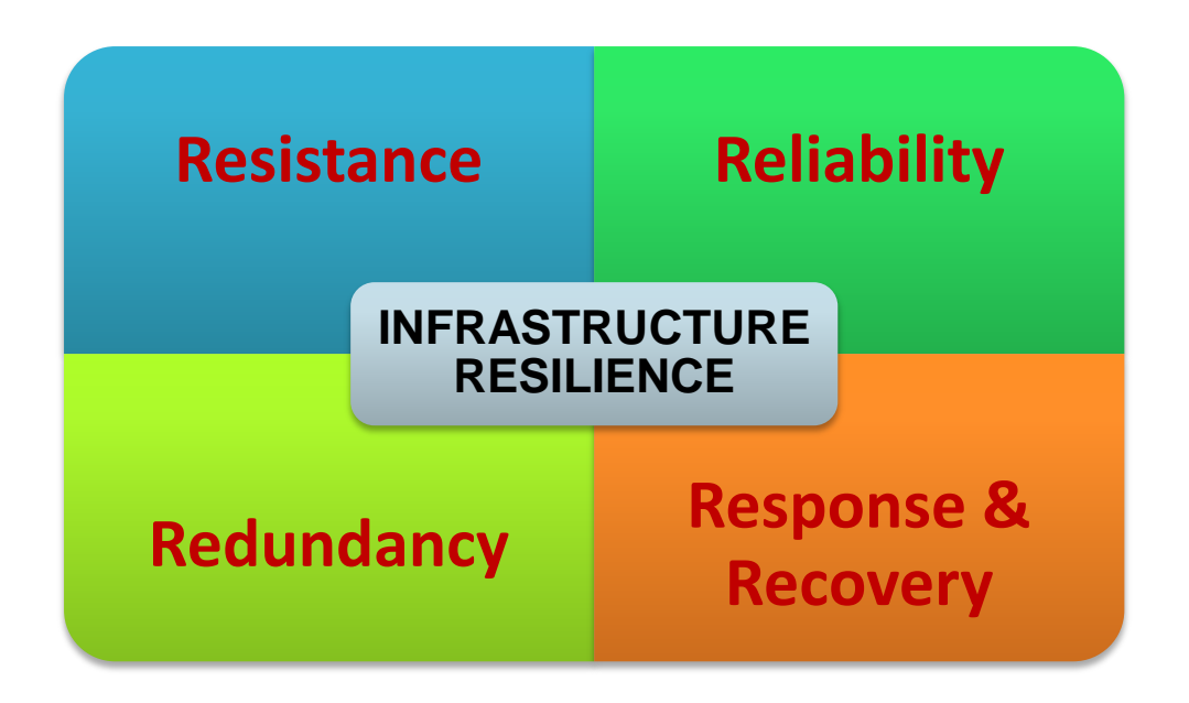
Figure 2: The components of infrastructure resilience: In building resilience, the contribution made by each of these four components needs to be considered