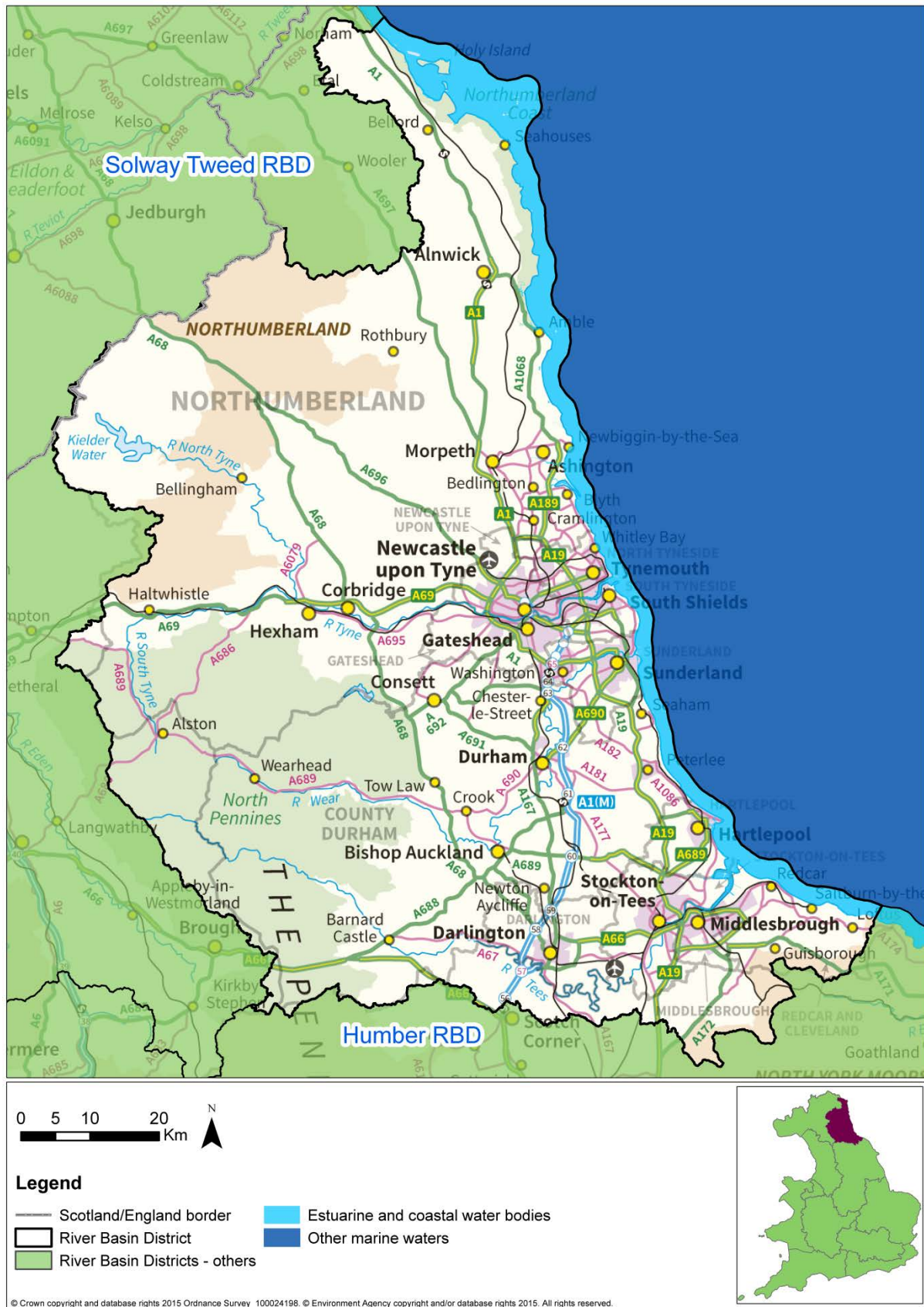
Figure 1: Map of the Northumbria river basin district