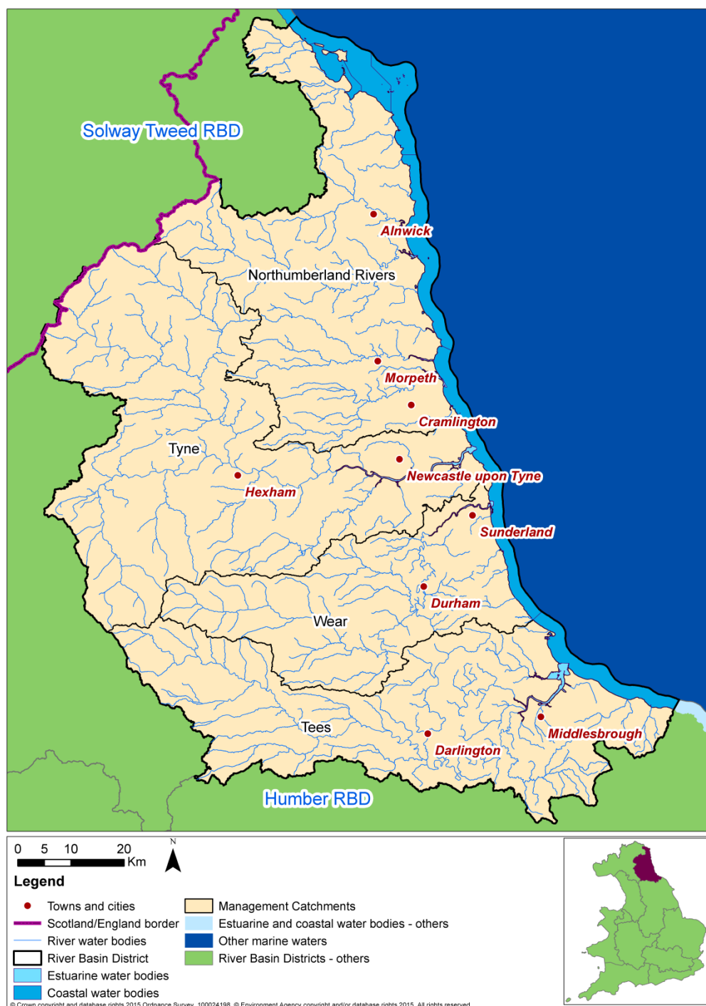
Figure 2: Management catchments within the Northumbria river basin district

Catchment partnerships are a major initiative to encourage local action to protect and enhance the water environment. The catchment based approach allows flexibility in the geographic scale at which catchment partnerships operate. Most catchment partnerships operate at the water ‘management’ catchment scale. Some operate at a smaller catchment scale. The partnerships consist of a wide range of stakeholders with an interest in the water environment. This includes, but is not limited to, local government, angling interests, wildlife organisations, water companies, land managers, business representatives and government agencies. Figure 2 shows the management catchments in the river basin district.