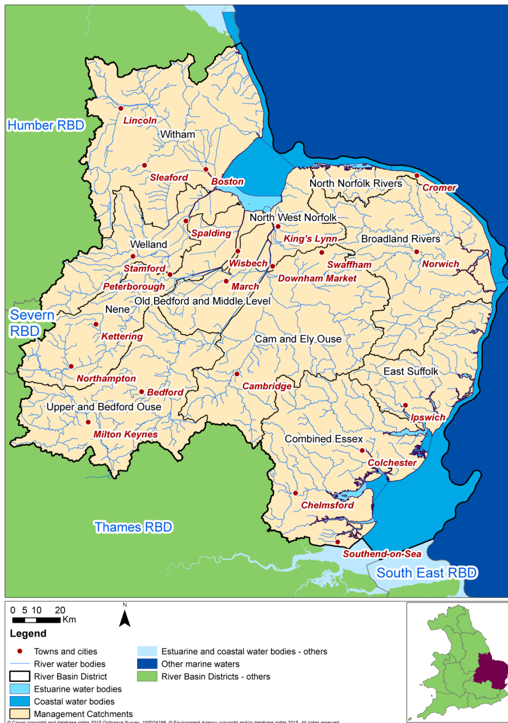
Figure 2: Management catchments within the Anglian river basin district

Catchment partnerships are a major initiative to encourage local action to protect and enhance the water environment. The catchment based approach allows flexibility in the geographic scale at which catchment partnerships operate. Most catchment partnerships operate at the water 'management' catchment scale. Some operate at a smaller catchment scale. The partnerships consist of a wide range of stakeholders with an interest in the water environment. This includes, but is not limited to, local government, angling interests, wildlife organisations, water companies, land managers, business representatives and government agencies. Figure 2 shows the management catchments in the river basin district.