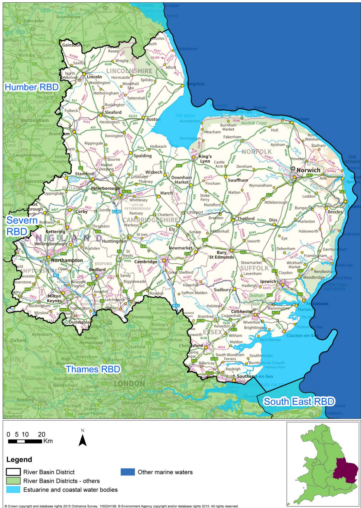
Figure 1: Map of the Anglian river basin district