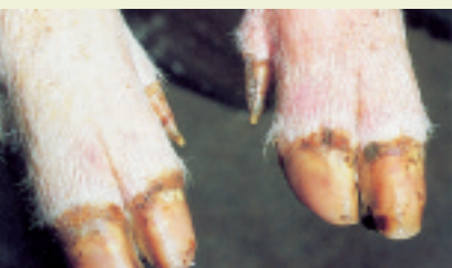
Infected pig's hooves.