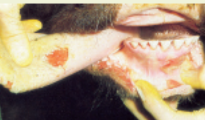
Two-day-old ruptured blister on tongue, lower gum and lower lip of a steer.