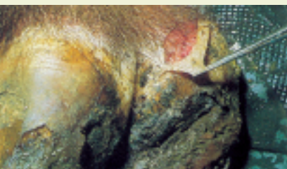
Blistering on foot of a steer.