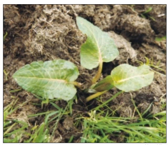
ung plant Maggy Milner

A, upper part of stem with a leaf and a lateral branch, and a leaf from the middle part of the stem; B, fruiting-perianth enclosing the fruit and transverse section of same showing seeds; C, plant. Not to scale.