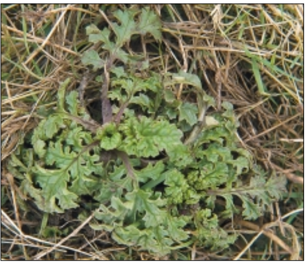
Young plant N

A, plant; B, a lower leaf; C, flowering branch D; disc flower; E, corolla of disc flower, partly cut away to show the stamens, and the style; F, mature achene from disc flower – some of the pappus cut off. Not to scale .