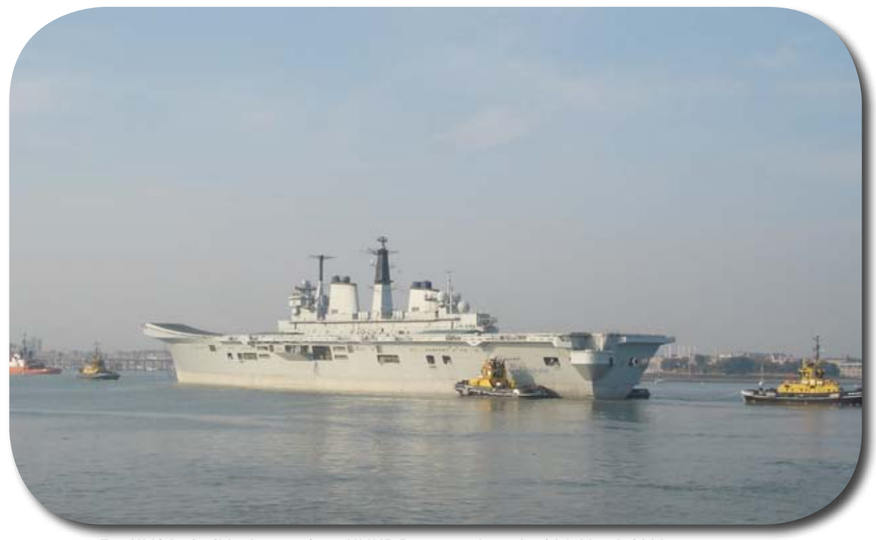
Ex -HMS Invincible departs from HMNB Portsmouth on the 24th March 2011

HMS Invincible is the 14th successful ship to be recycled for DE&S Disposal Services Authority (DSA).