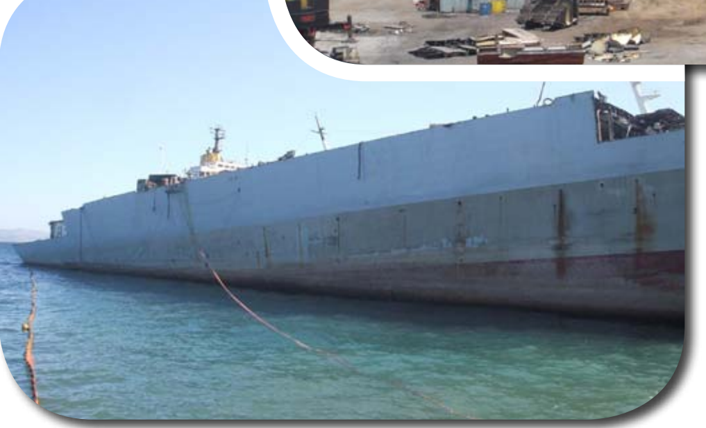
Progress of Works July 2011

Progress of works showing dismantling of superstructure June 2011