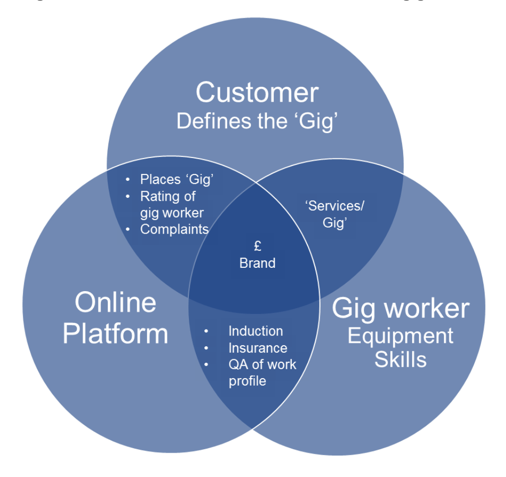
Figure 1: Nature of interaction between customer, gig worker and online platform