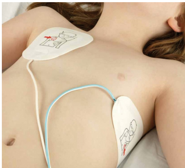
Figure 3: Paediatric AED pad placement (for use on children aged up to 8 years of age, or weighing under 25 kg) 6