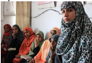
Mandra's Lady Health Workers

Further support from UK aid will prevent another 3,600 mothers' deaths by 2015 and allow 400,000 more families to choose the number of children they have.