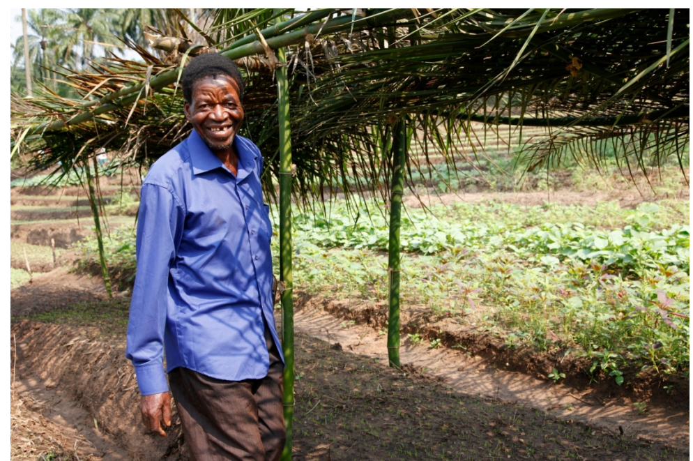
Sowing the seeds of a brighter future, MasiManimba, DRC