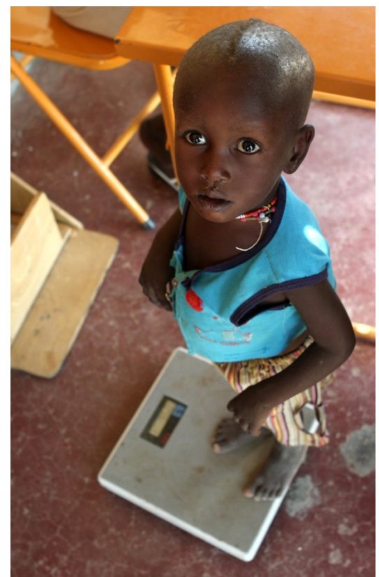
A young child being weighed for malnutrition, Turkana, Kenya

This paper is informed by targeted searches of electronic journals and online databases (ScienceDirect, PubMed, the Cochrane library, Oxford journals, The Lancet, the BMJ and Cambridge journals). A search was also conducted for data and reports from the World Bank, UNICEF, the Food and Agriculture Organization (FAO), the World Health Organization (WHO) and other relevant reports or position papers by governmental and non-governmental organisations and international bodies. Where possible this paper draws on systematic reviews, peer-reviewed journal articles, meta-analyses and Randomised Control Trials (RCTs). Some of the new and emerging areas are less well researched and rely on organisational reports pending new research.