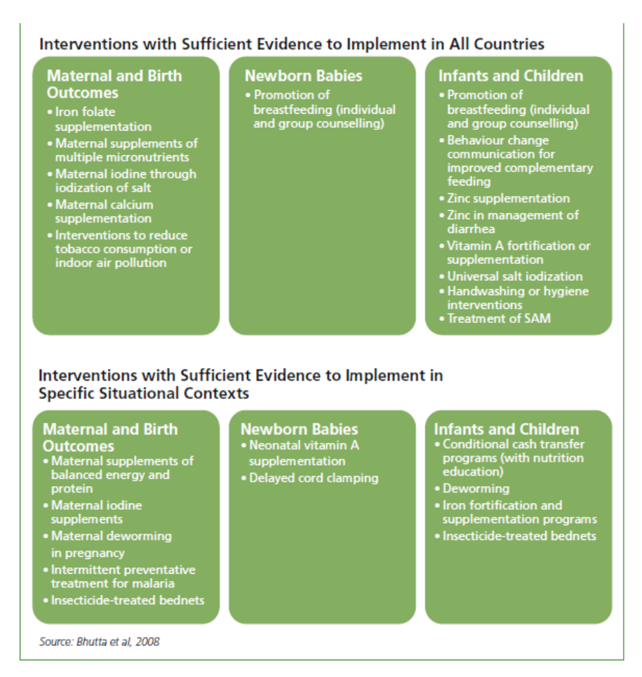
Figure 4. The Lancet 2008 key interventions

And it seems that investing in nutrition represents value for money in comparison with other development interventions. The 2008 Copenhagen Consensus – in which eminent economists weight the value for money of a number of potential development interventions – ranked three nutrition interventions in the top five development solutions. These were Vitamin A and zinc supplements for children, fortification of staple foods, and micronutrient fortification. The 2012 Copenhagen Consensus went on to rank improving nutrition as the top development intervention. Even following conservative assumptions, the benefit to cost ratio was estimated at 15:1 – and using less conservative estimates, this rises to a maximum of 138.6:1 (Copenhagen Consensus, 2012, Hoddinott et al. 2012). Citing an earlier study, which attempted to model the costs of scaling up these interventions (Horton et al. 2010), the authors note that a $3 billion investment would provide this bundle of interventions to 100 million children (Hoddinott et al. 2012). The most effective nutrition interventions focus on the 1,000 day 'window of opportunity' from the start of pregnancy to two years of age because interventions targeted in this timeframe are best able reverse the impact of stunting and cognitive impairment.