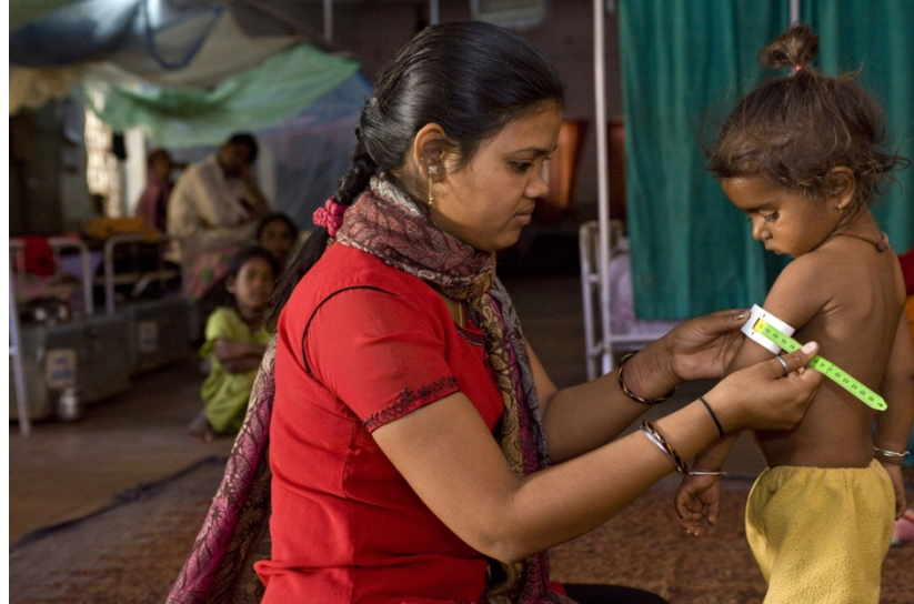
Measuring the weight of malnourished children, Madhya Pradesh, India