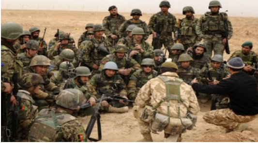
Tackling conflict overseas in the UK's national interest

The National Security Council (NSC) has directed an increased focus on tackling such threats at source, rather than when they have escalated to full-blown conflict or materialised on UK territory. This approach, underpinned by our commitment to human rights and justice, will be delivered through close cooperation with our key partners and international organisations, including the UN.