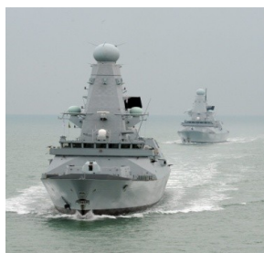
Type 45 Destroyers