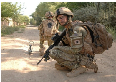
Soldiers on Patrol