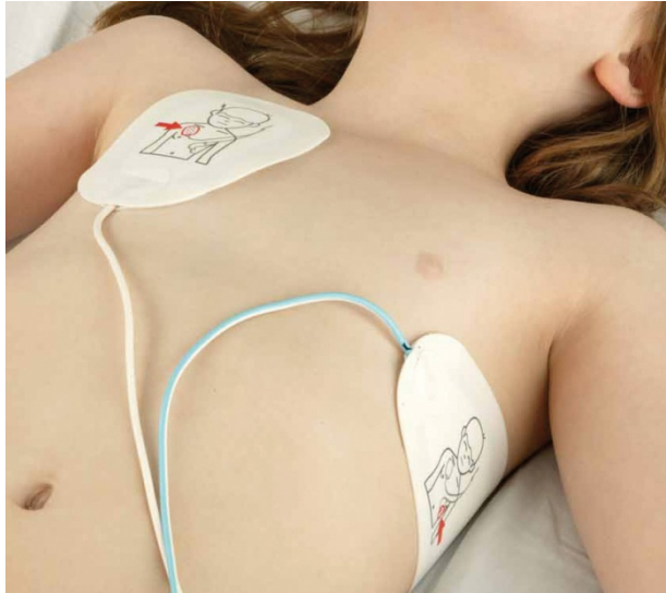
Figure 3: Paediatric AED pad placement (for use on children aged up to 8 years of age, or weighing under 25 kg) 6