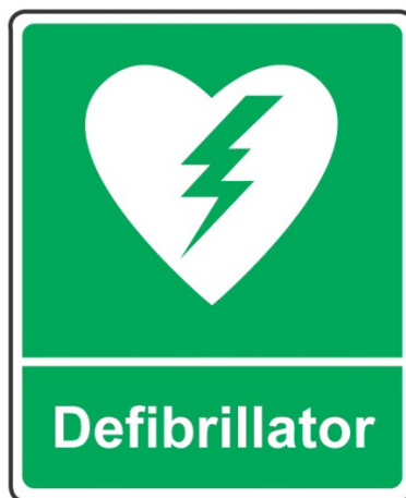
Figure 4: The UK standard sign for AEDs

All cabinets and wall brackets should be clearly marked using a standard sign for AEDs. The design recommended by the Resuscitation Council (UK) is shown below. 8 Some suppliers may provide this as part of the AED purchase.