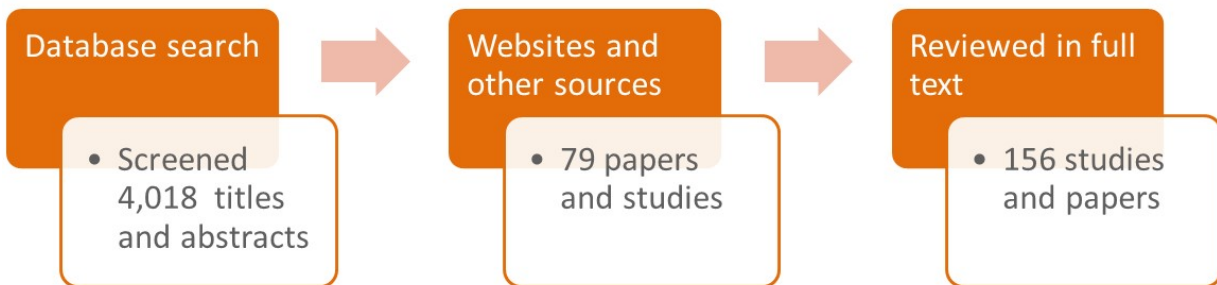
Figure 3: Flow of literature for this review

32 studies and reports and 11 systematic evidence reviews have been included in the review. The overview of the studies included is presented in the next section. The list of included studies is presented in Appendix 2 and summaries of all the included papers are presented in Appendix 3. Although the rapid evidence review is based on a robust and thorough method, the list of studies is not an exhaustive one.