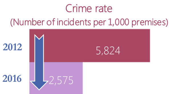
This fall is statistically significant

Most common crime types: fraud, assaults and threats, and theft