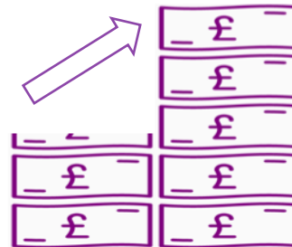
AVERAGE COST OF SHOPLIFTING PER VICTIM

This increase is statistically significant