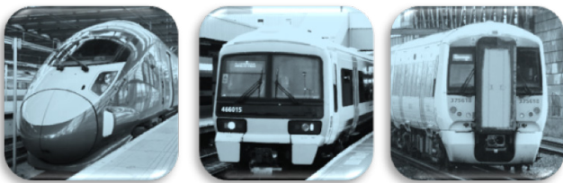
Figure 2: Southeastern rolling stock types.

3.7 The High Speed service has been an extraordinary success. Opened in full in 2007, High Speed 1 is the first high-speed railway in the UK capable of operating at speeds of up to 140 miles per hour for domestic services. This has led to a dramatic improvement in the commuter service between London and Kent and, consequently, demand has soared. The service is now crowded during peak hours, and providing more space is a priority.