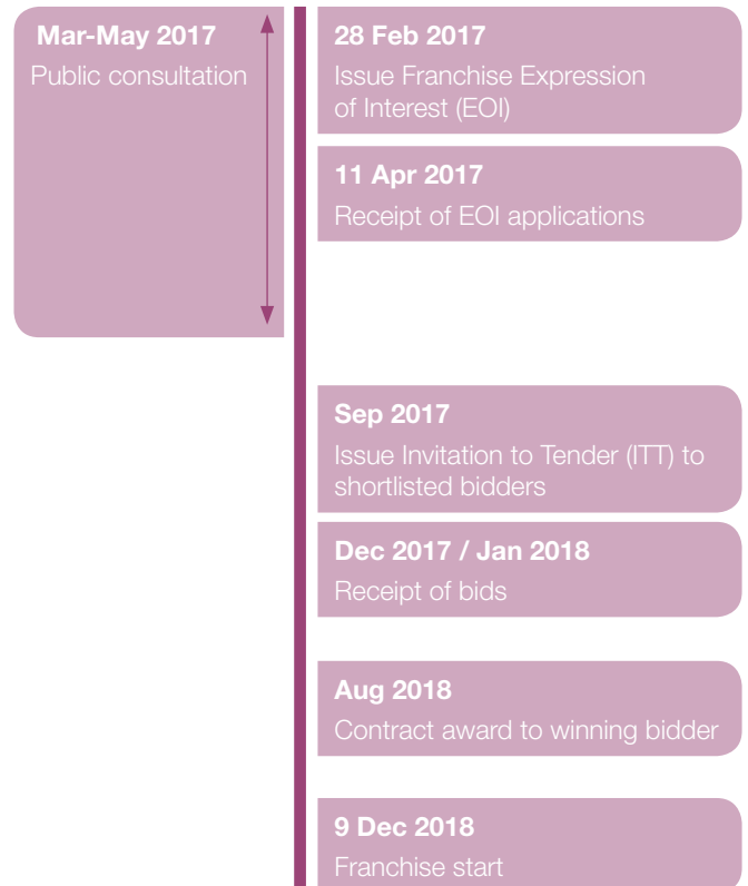
Figure 4: South Eastern franchise competition timetable