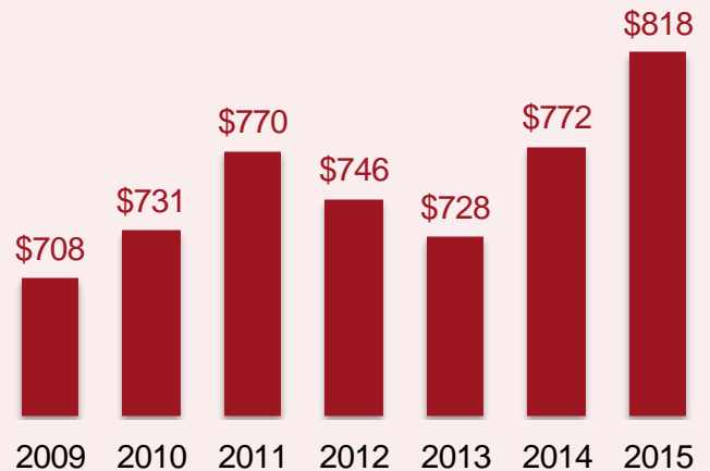
MO: Services Exports to the UK ($ million)