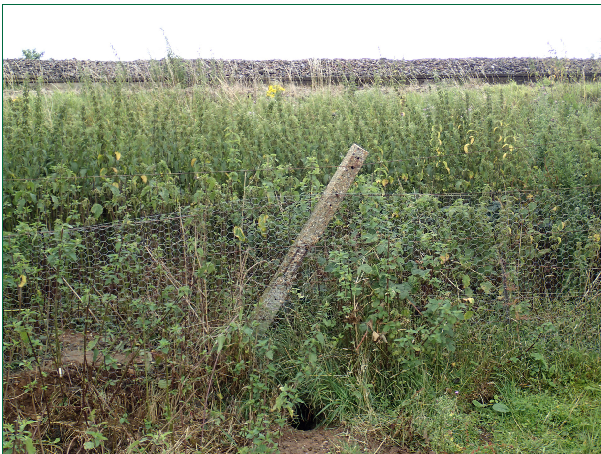
Figure 7: Degraded section of fence at Godmersham (unaffected by the animal incursion)