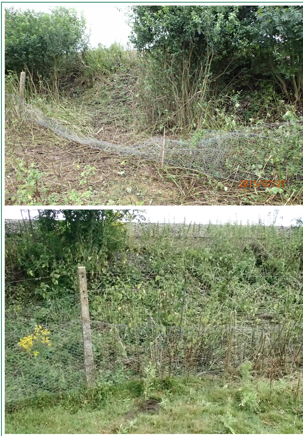
Figure 5: Sections of fence at Godmersham showing the site which was breached by the cows (top) and a representative area approximately 40 metres from the animal incursion (bottom)