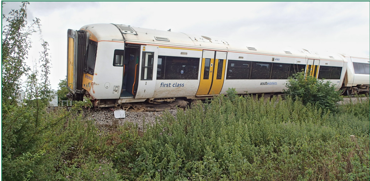
Figure 2: The derailed leading carriage of train 2R66