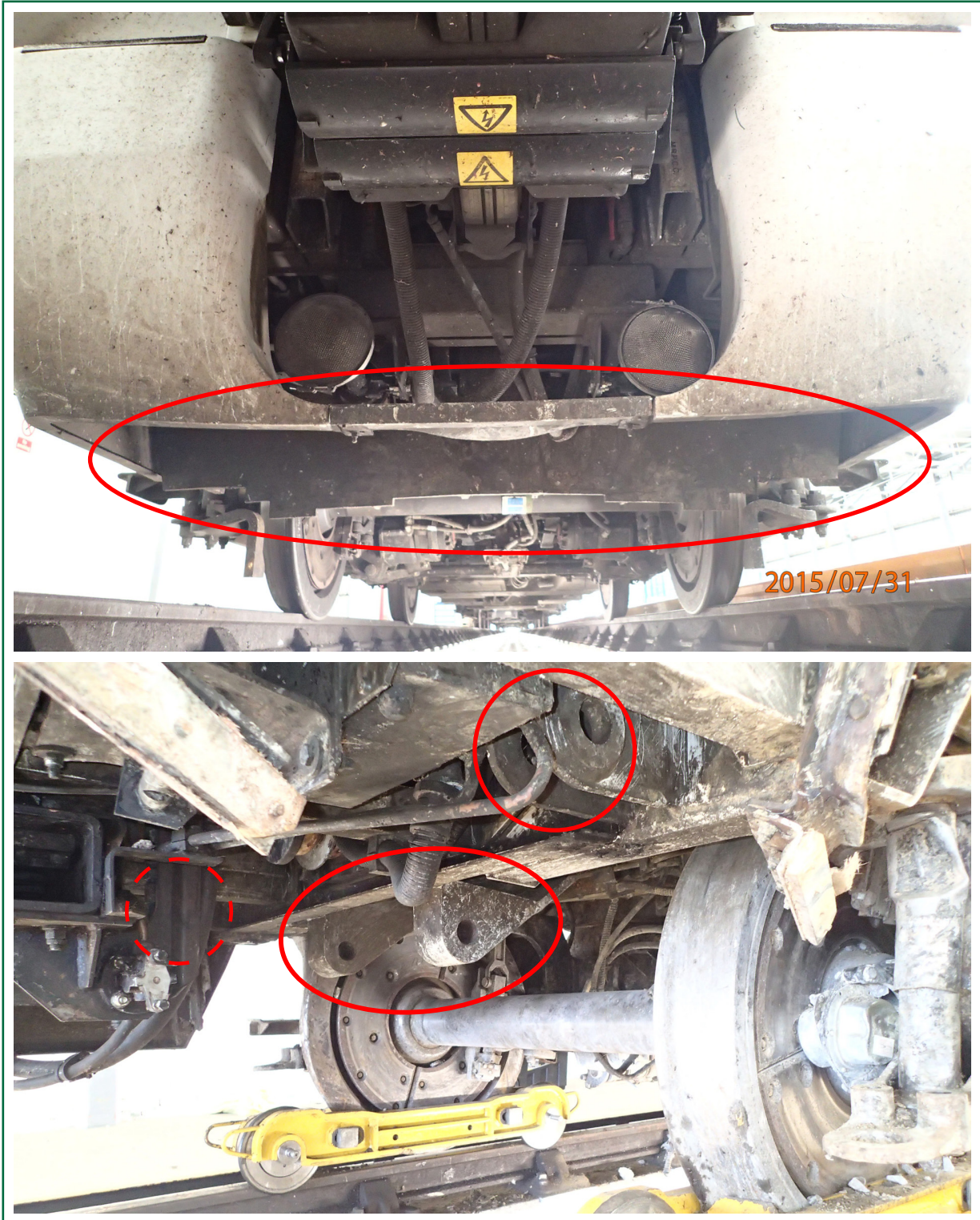
Figure 8: Comparison of the leading end of unit 375612 (top) and the leading end of unit 375703 (bottom), showing the presence or absence of obstacle deflectors respectively (obstacle deflectors and mounting brackets circled in red; one mounting bracket not visible in bottom image). Note that the unit in the bottom image is mounted on wheel skates for recovery purposes.