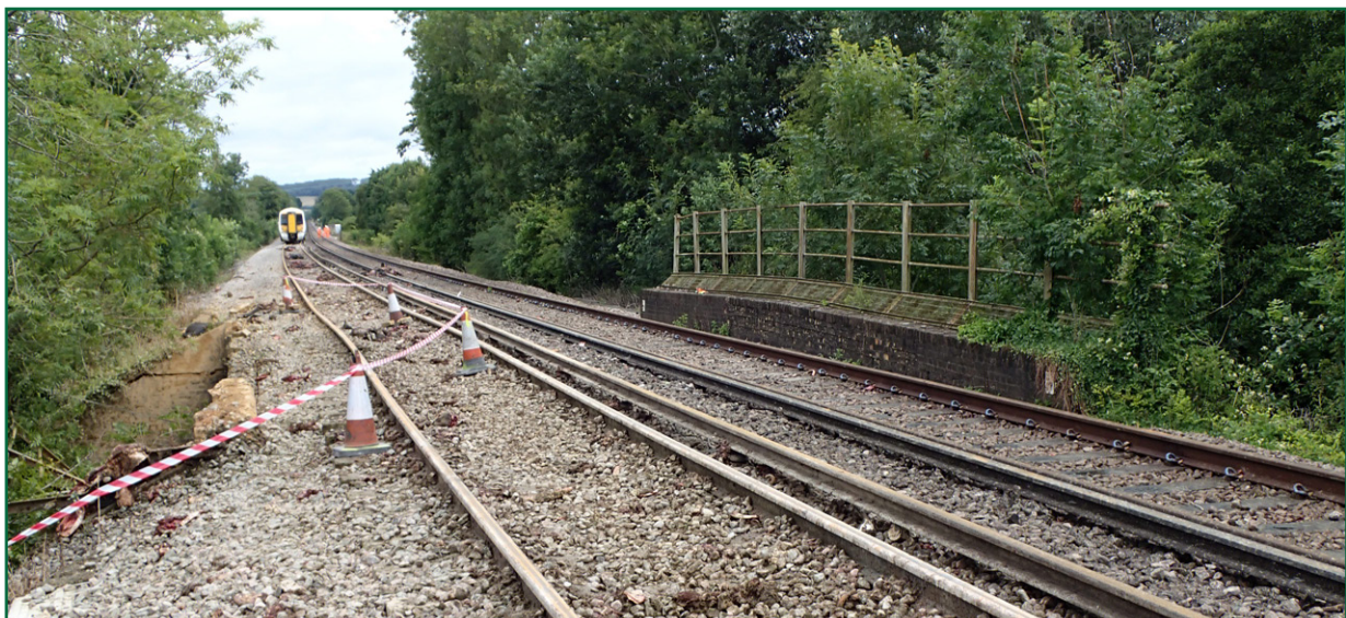
Figure 3: View of damage to the track and bridge as a result of the derailment