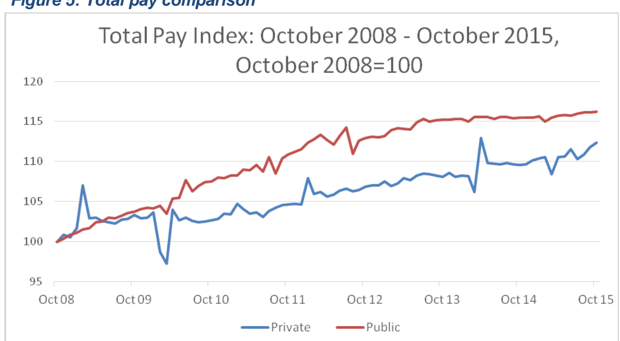
Figure 5: Total pay comparison