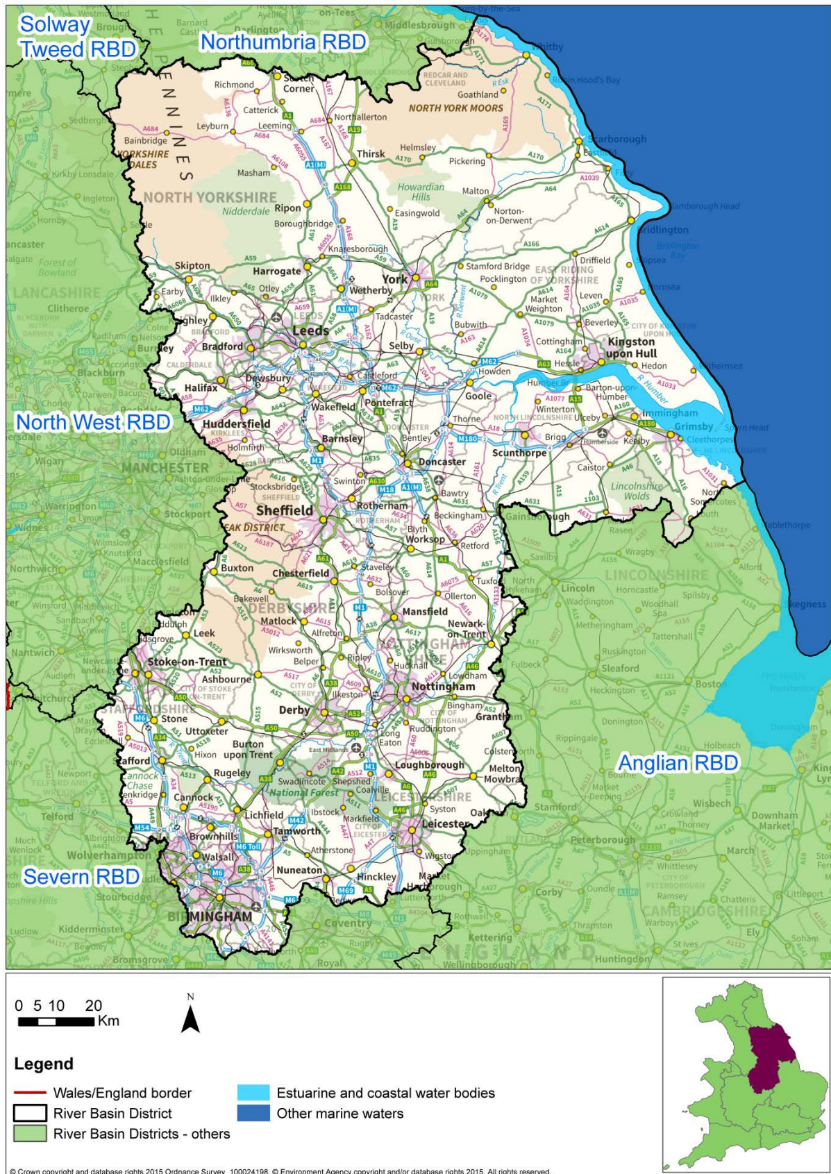
Figure 1: Map of the Humber river basin district