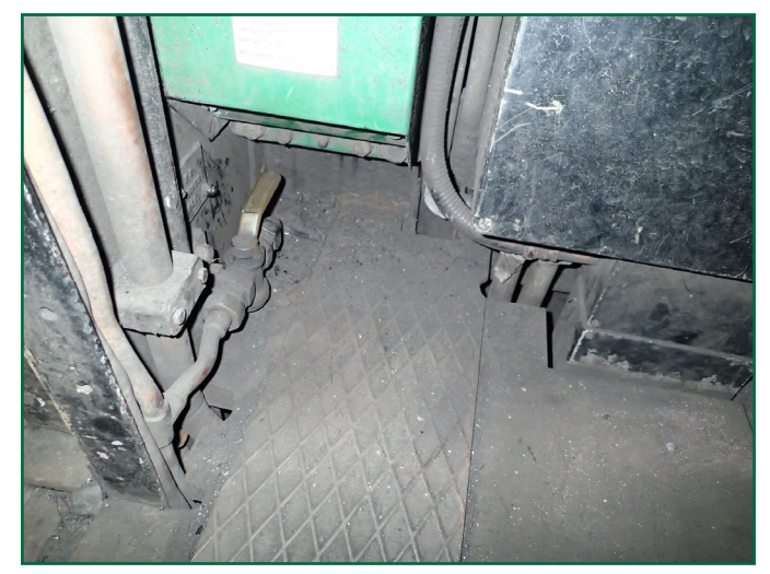
Figure 3: The AWS isolating cock