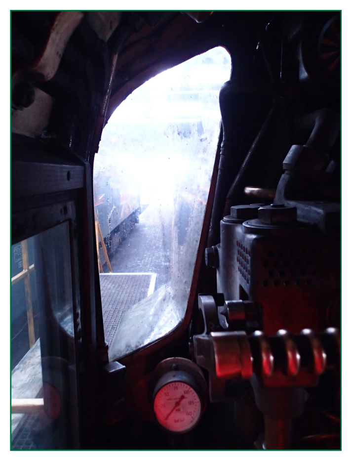
Figure 4: The driver's windscreen on Tangmere – note this image was taken after the incident with the train at a stand and does not show the extent of driver's visibility on 7 March 2015

16 The driver controlled the train's brakes throughout the journey using the vacuum brake controller valve. This had the effect of controlling the brakes on the locomotive, its tender and the twelve coaches connected to the automatic vacuum train pipe.