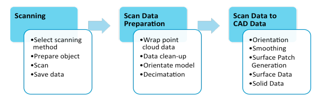
Figure 1: Workflow for scanning an object

Although errors in scanned digital models can be rectified, this can be a highly complex procedure, requiring skill, time and expensive software; often the scanning element is only a small part of the reverse engineering workflow. The diagram below shows the 3D scanning workflow prior to 3D printed part production.