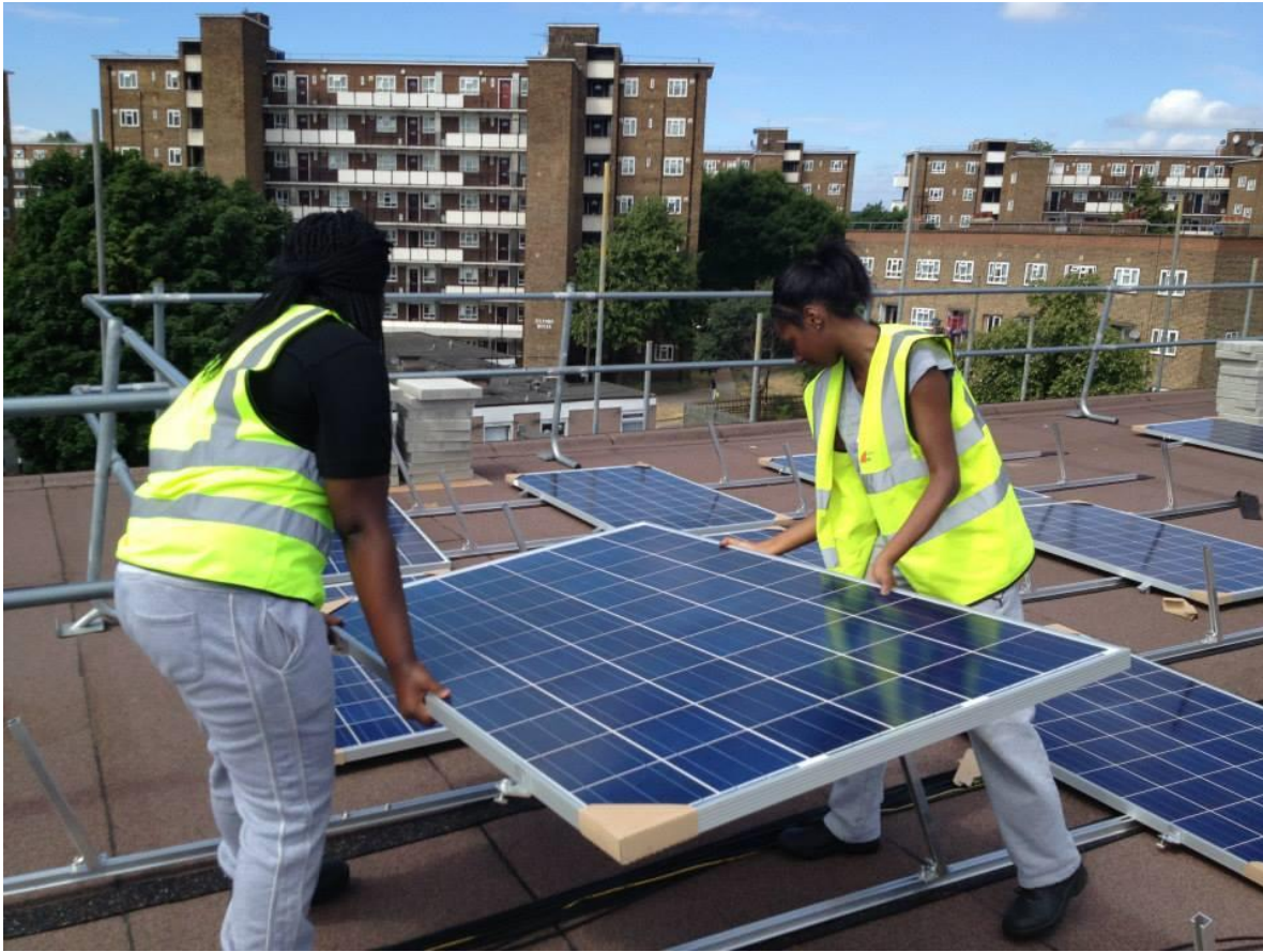
Repowering London work experience programme in Roupell Park Estate, Brixton