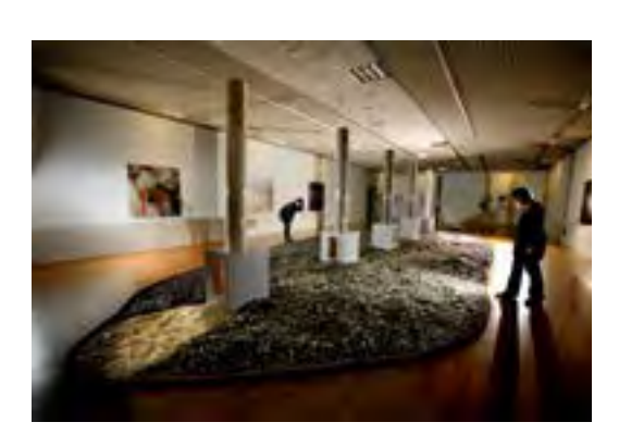
6 million+ at Huddersfield Art Gallery

One notable travelling memorial was the 6 million+ project which toured the UK from 2007 to 2011. Kirklees Council initiated a project through the Huddersfield Art Gallery to collect six million buttons and commissioned an art installation to commemorate the Holocaust and other victims of Nazi persecution and subsequent genocides. The installation is now made up of over six million individual buttons, donated by people from across the UK – and there are plans to build Yorkshire's first public Holocaust memorial based on this installation.