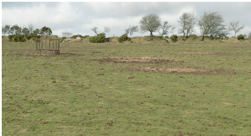
Choice of well drained, flat fields for out-wintering stock reduces the risk of soil erosion