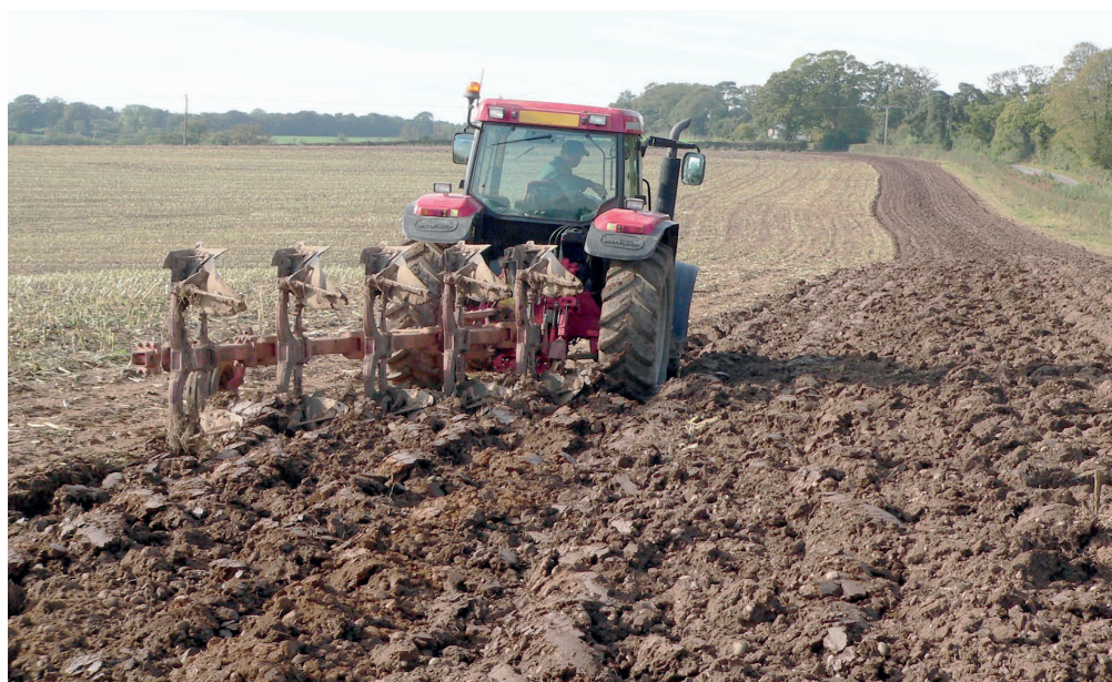
Compacted land can be loosened by mouldboard ploughing, chisel ploughing and subsoiling where appropriate

With slow draining, heavy soils on slopes it may be better not to grow high risk crops that will be harvested late in the year.