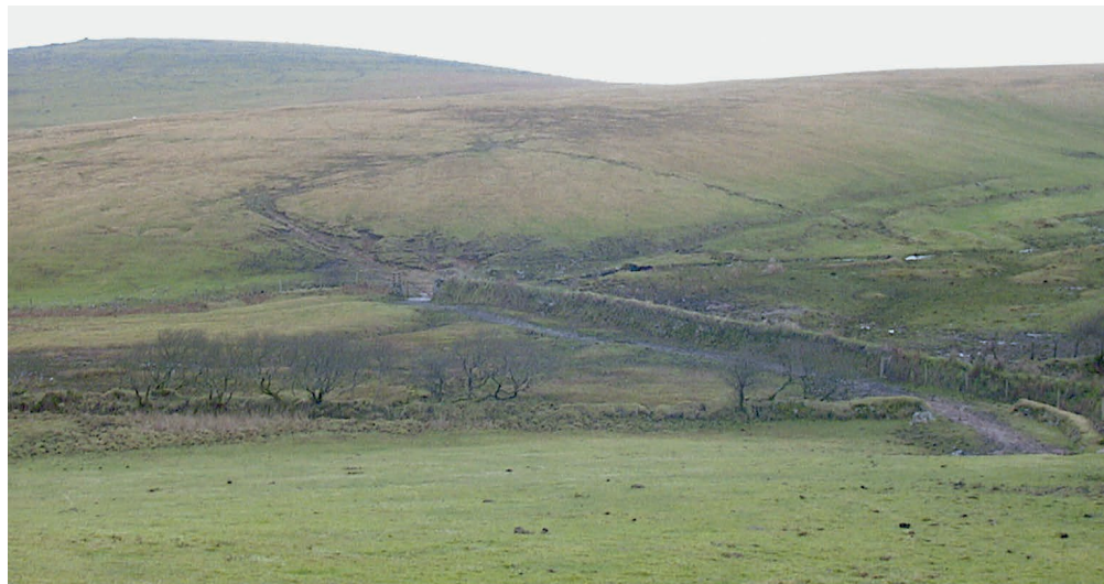
Out-wintering, supplementary feeding of stock, and use of sacrifice fields in upland areas can cause soil erosion.

Supplementary feeding and the use of tracks, particularly on slopes and next to watercourses, can increase the risk of erosion.