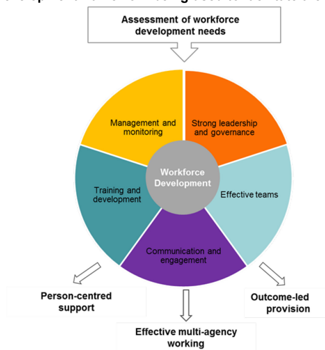
Figure 3 Workforce development framework being used to facilitate the reform process

... to ensure that workforce development activities help to achieve the three main objectives: 1) person-centred support; 2) multi-agency working, and 3) outcomes-led provision 4 .