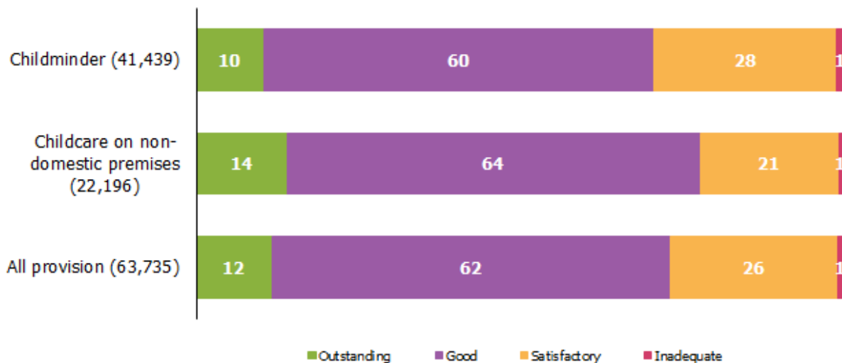
Chart 2: Overall effectiveness of active early years registered providers at their most recent inspection as at 31 March 2012, by provider type (provisional) 1 2

1. Percentages are rounded and do not always add exactly to 100.