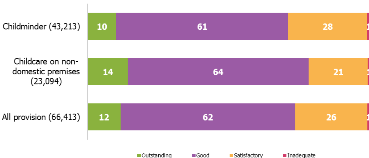
Chart 2: Overall effectiveness of active early years registered providers at their most recent inspection as at 30 June 2012, by provider type (provisional) 1 2 3

1. Percentages are rounded and do not always add exactly to 100.