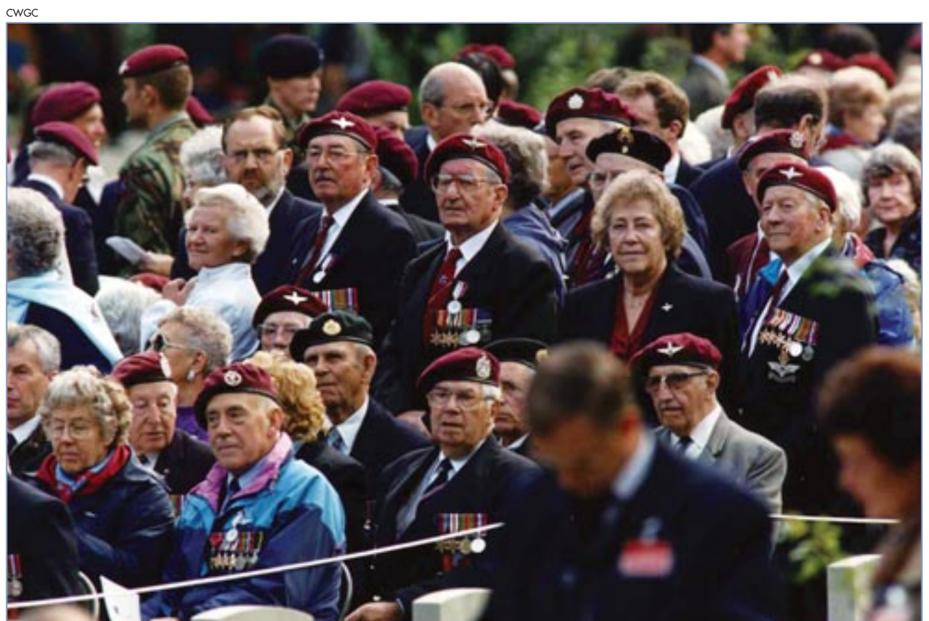
50th anniversary of Operation Market Garden