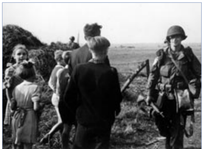
The first US airborne troops are greeted by Dutch locals as they move off their drop zone on 17 September

With German pressure on 1st Airborne Division increasing and with no sign of the imminent arrival of XXX Corps, Urquhart decided on 20 September to defend a thumb-shaped perimeter at Oosterbeek, with its base on the river. It was during this fighting that Lance-Sergeant John Baskeyfield held the enemy at bay with 6-pounder anti-tank guns. He was later awarded a posthumous VC.