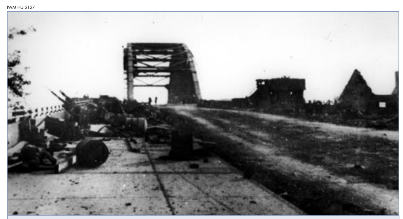
A German photograph of the northern end of Arnhem bridge taken after the surrender of the British airborne troops there on the morning of 21 September

A brigade of 43rd (Wessex) Division attacked towards Driel the following morning, Friday 22 September, and completed the link up between XXX Corps and the airborne forces. But this was no time for self-congratulation, as Urquhart's division was in a precarious state and desperately required reinforcement. That evening 35 Poles managed to cross to Heveadorp in four rubber boats and joined the defence of the perimeter, but so few made little difference to the division's prospects. As they crossed, the German commanders planned the final destruction of Urquhart's men for the next