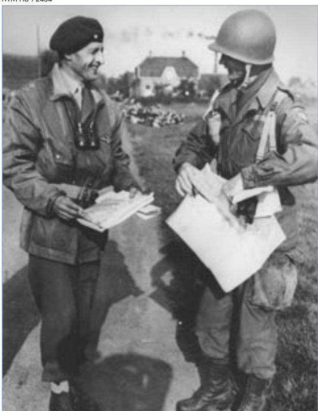
The commander of I British Airborne Corps, Lt-Gen Frederick Browning, and Brig-Gen James Gavin, commander of 82nd US Airborne Division, just outside Groesbeek

Nijmegen, while Kampfgruppe (battle group) 'von Tettau' and Lieutenant-General Willi Bittrich's II SS Panzer Corps, specialists in defence against airborne landings, were located around Arnhem. The two battered armoured divisions that made up Bittrich's II SS Panzer Corps, 9th SS Panzer Division and 10th SS Armoured Division, amounted to no more than 3000 men each and had only about 12 functioning tanks between them. As a consequence, they were reconfigured as SS-Kampfgruppe 'Hohenstauffen' and SS-Kampfgruppe 'Frundsberg' respectively (a 'Kampfgruppe' or 'battle group' being an improvised formation smaller than a division).