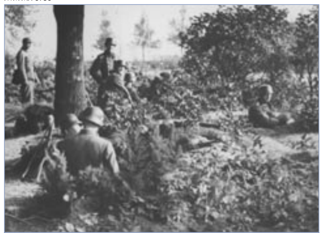
German defensive preparations to the west of Arnhem

jeeps of an important coup de main force, Major 'Freddie' Gough's Reconnaissance Squadron, which had been sent along Leopard route to seize the Arnhem road bridge. When 1st Battalion followed them a little later and found the route blocked, they desperately tried to outflank Krafft to the north, but finally gave up and headed south east towards Oosterbeek.