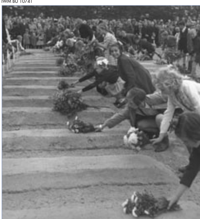
Dutch children lay flowers on the graves of the men of 1st British Airborne Division in the Arnhem-Oosterbeek War Cemetery in September 1945