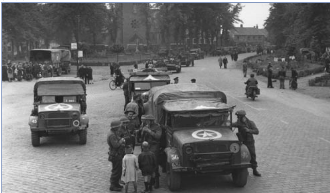
The centre of Valkenswaard following the arrival of XXX Corps after the Irish Guards had first entered the town

Also by the end of 17 September, the Guards Armoured Division had managed to crack the outer crust of the German defences around the Dutch border, with the support of rocket-firing Typhoons of the Second Tactical Air Force, and had reached Valkenswaard for the loss of nine tanks. However, the critical bridge at Son had been blown despite attempts by 101st Airborne Division to capture it intact, and the Germans' ability to stall XXX Corps' attack was evident in the first hours of the battle. Advancing along a single narrow road which made it relatively easy for the Germans to hamper XXX Corps' progress; traffic jams were common and resupply to the lead elements was extremely difficult. The British ground forces, therefore, had to use all of their hard won experience and fighting skill to force their way forward. The next day saw the reinforcement of all three airborne divisions. At 1500 on 18 September, west of Arnhem, 4th Parachute Brigade, divisional troops and the remainder of 1st Airlanding Brigade touched down on Dutch soil. But the resupply drop that took place soon after their arrival was of very limited use as the drop zone had fallen into German hands.