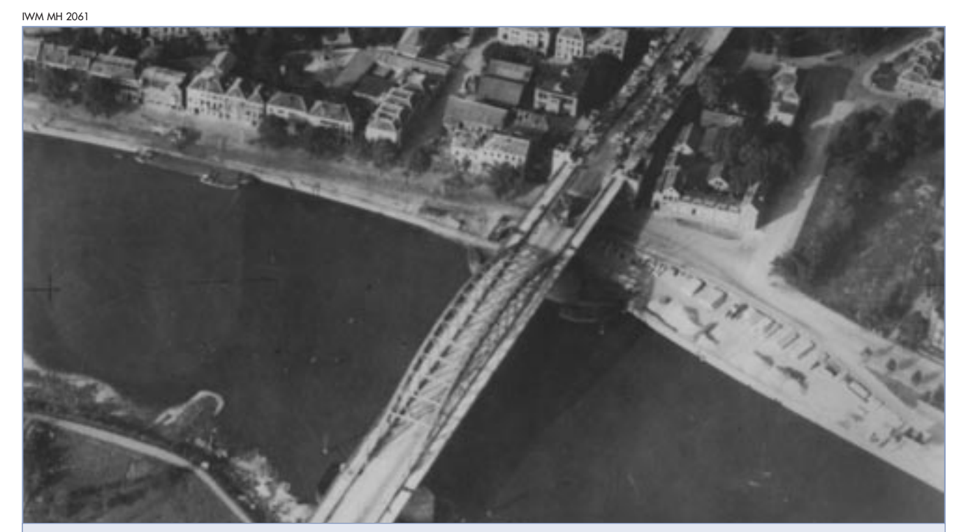
An aerial reconnaissance photograph of the Arnhem road bridge taken on 18 September