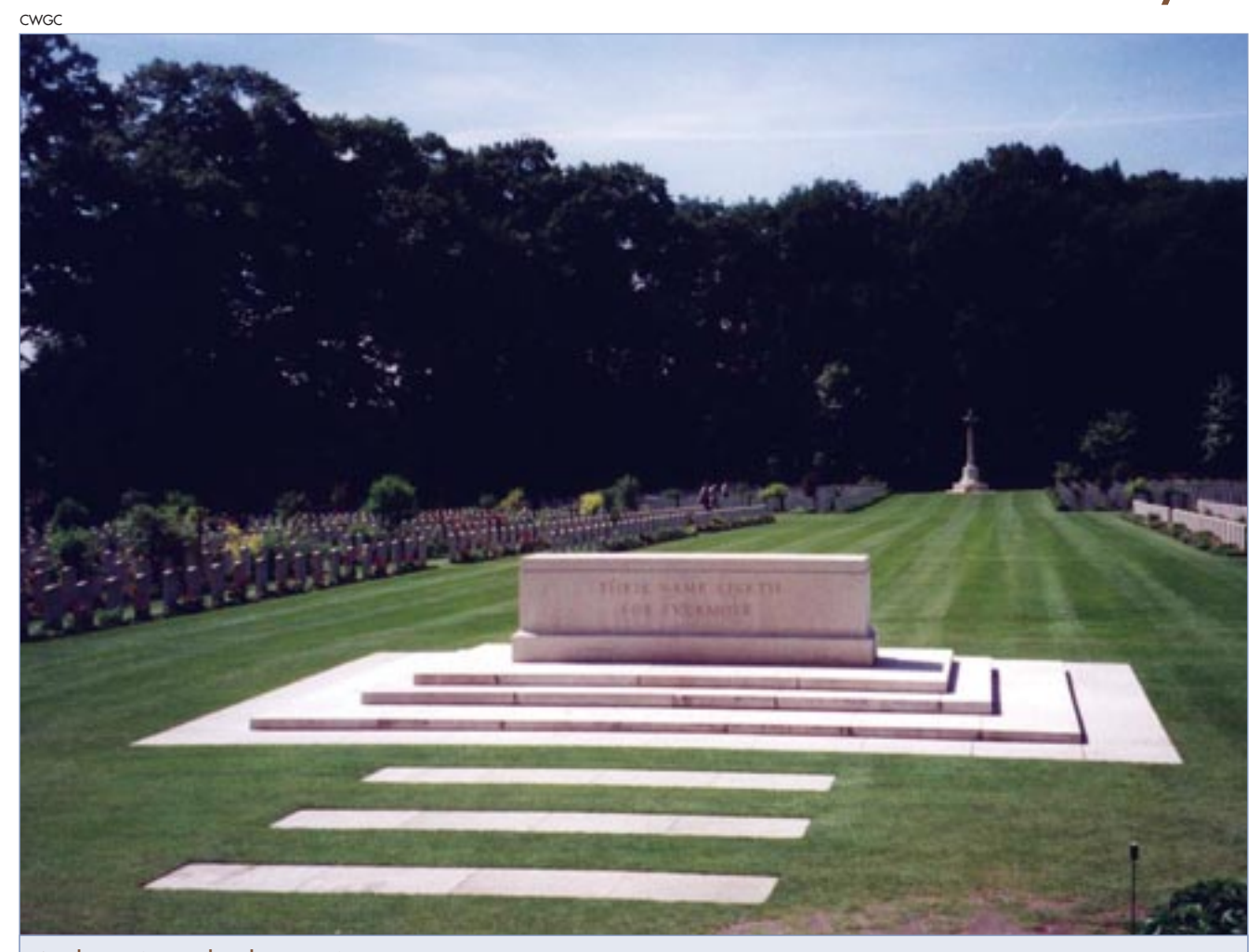
Arnhem-Oosterbeek War Cemetery

The entire Operation Market Garden corridor has, inevitably, become much more difficult to negotiate in recent years due to an increase in traffic, road building and urban development. Nevertheless, it is still possible to drive the route that XXX Corps took in September 1944 without too many deviations, and to find the sites where the American airborne divisions landed and fought. There are also a number of good museums on the battlefield and the Groesbeek National Liberation Museum is highly recommended. Both Eindhoven and Nijmegen are worth visiting although both have changed considerably since 1944. Even so, the area around the Nijmegen road and railway bridges repays exploration as