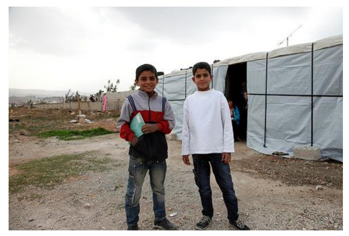
Providing shelter with Save the Children in Lebanon.

Across the region, UK funding aid has helped to deliver a range of shelter/essential relief item supplies, more than 84,600 , to Syrian refugees and to communities hosting Syrians displaced by the violence.