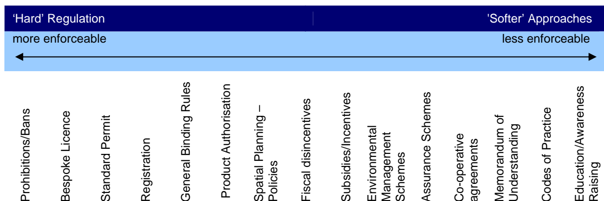
Figure F.1: Types of approaches for mechanisms

These mechanisms are already used to apply many of the so-called 'basic' measures to protect waters and the dependent ecology. These measures have helped achieve greatly improved standards and represent a considerable amount of activity and investment. They need to continue in order to prevent deterioration.