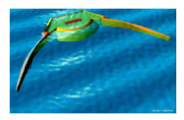
"Wave Dragon" – wave turbine installation- recommended colour above the water is yellow.