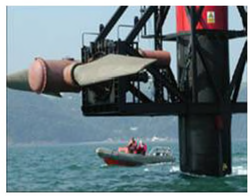
"Seaflow" project – tidal turbine installation. Coloured red and black as isolated danger.