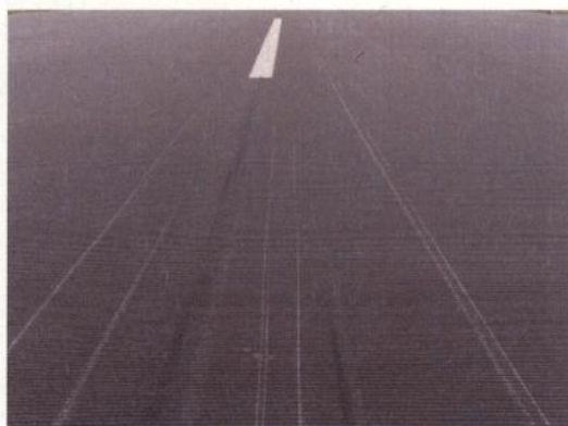
Fig 4 – Scrape Marks on Runway.