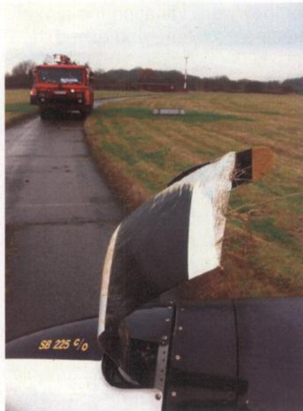
Fig 3 – Close-up of Damaged Propeller.