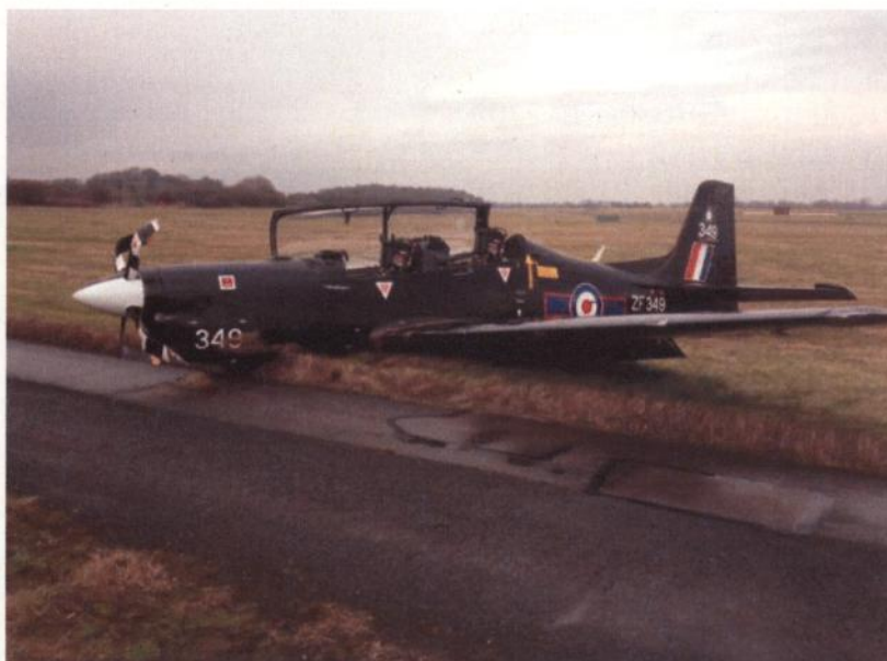
Fig 2 – Aircraft After Egress.