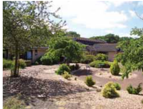
Ifford Park Polish Home

This purpose-built home near Newton Abbot, Devon which provides residential and nursing care to people who qualify for admission under the Polish Resettlement Act 1947, is managed and administered by the SPVA. Our staff at Ifford Park aim to offer high quality residential and nursing care, which is endorsed by the independent body, Commission for Social Care Inspection. Despite the increasing age of our service users, considerable demand for places at IPPH has continued over recent years resulting in an annual year to date figure of 95.4% occupancy levels. The Home accommodates 98 residents, with an average age of 84. It is inevitable that admissions to the Home will decline as this specific population decreases, however a recent review of the Home has not predicted a significant decline in the near future.