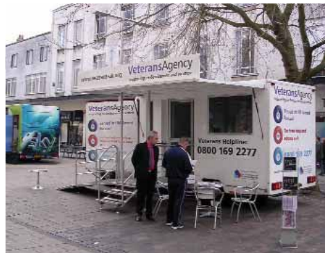
Veterans Mobile Advice Unit in London

This last year has seen the new name of 'Veterans Welfare Service' (VWS) replace that of the 'War Pensioners Welfare Service', the first change since 1948. The change is reflective of the diverse work now undertaken in respect of the Veterans community, supporting through the discharge process, bereavement and future key life events.