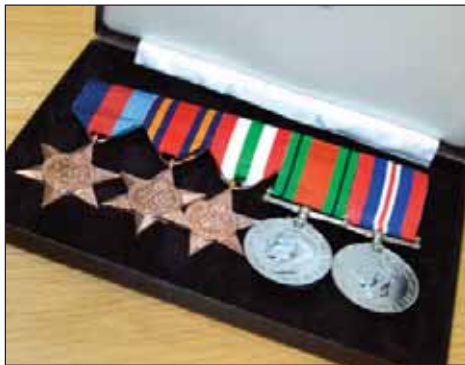
1939-45 War Medal, 1939-45 Defence Medal, 1939-45 Star, Burma Star and Italy Star. All five medals relate to service in the Second World War and have been issued by the MoD Medal Office

Over the course of the past year the MoD Medal Office has received and actioned 70,000 medal applications. The work in hand is now just under 2,000 applications. This is particularly noteworthy when placed against the 50,000 medal applications outstanding at the formation of the MoD Medal Office in March 2005. In addition, the MoD Medal Office has designed and commissioned tri-service JPA medal application forms and ensured that the guidance within the Joint Service Publication in support of current medal policy is up to date and accurate. Additionally, it has scoped a tri-service common standard of conduct to be achieved in the award of the Long Service and Good Conduct Medal. All this work has been fully supported and agreed by the three Services and as such is an important step towards achieving a common tri-service medal policy. Further improvements include the facility to submit medal applications on new tri-service JPA forms direct from Operational Theatres.