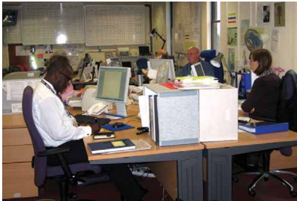
JCCC Christmas Working

Some of the significant activities for the Historic Casework Team have included arranging high profile commemorative funeral services, attended by Service representatives and family members for casualties from both World Wars. Also, the team enabled the provision of service pattern memorials following the business failure of the previous MoD contractor in February 2007 thus ensuring the continuity of supply was achieved resulting in only minimal disruption to bereaved service families.