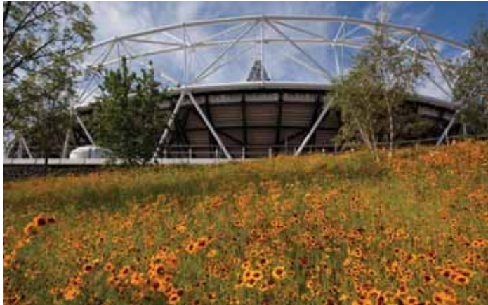
The Olympic Stadium - August 2010

In July 2010 the ODA announced the completion of the Olympic Stadium roof. Some 45,000 sq metres of material in 112 panels, stretched between an outer truss and an inner tension ring, had been fitted by a team of 23 expert abseilers. The covering will create the right conditions on the field of play and also provide protection for two thirds of spectators.