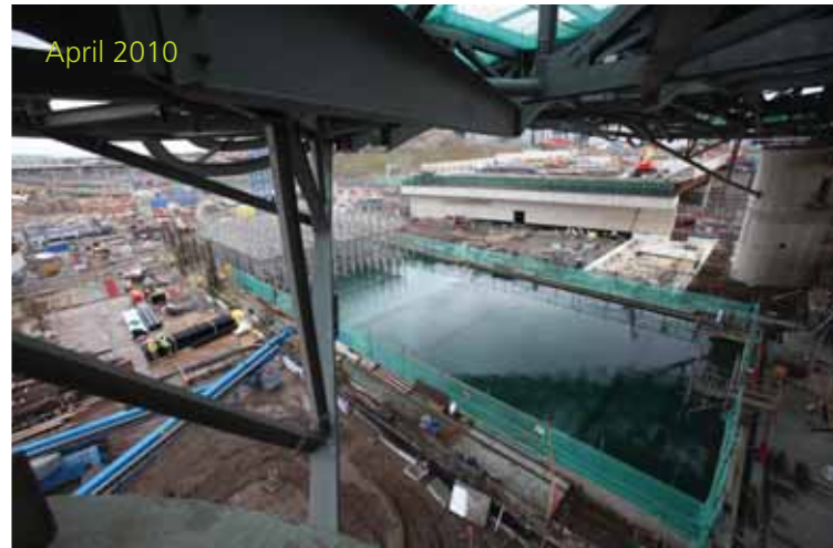
London 2012 Aquatics Centre

The National Lottery is contributing £1,835m to the London 2012 Olympic and Paralympic Games through the Olympic Lottery Distributor. £750m of this is being raised through the 'Dream Number', online Lottery draw games and scratch cards dedicated to the London 2012 Games.