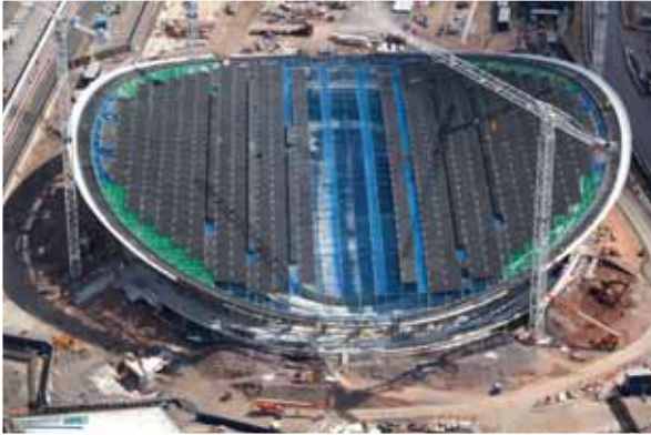
London 2012 Velodrome May and November 2010, February 2011