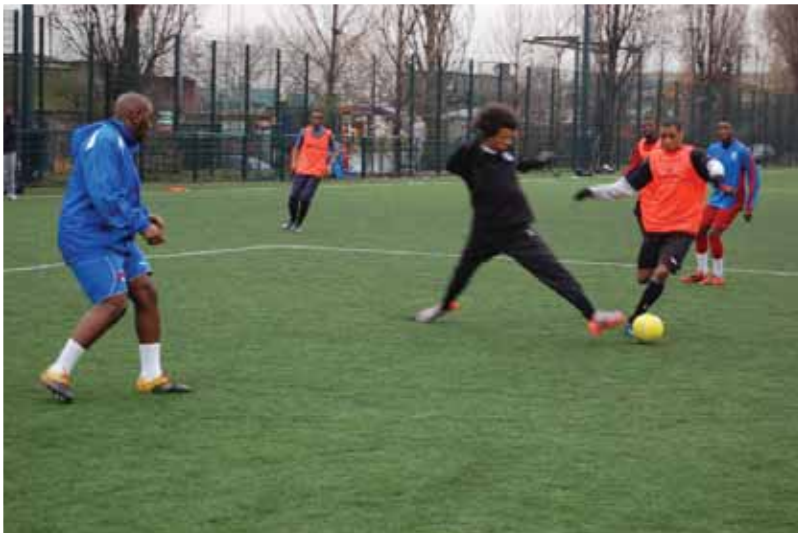
Transformers - Leyton Orient Ground event

The Olympic Lottery Distributor has used £1,755,485 of National Lottery funding to support Transformers and there are three funding rounds for the project. In January 2011, ELBA announced the first 14 successful community organisations to be awarded grants under this project.