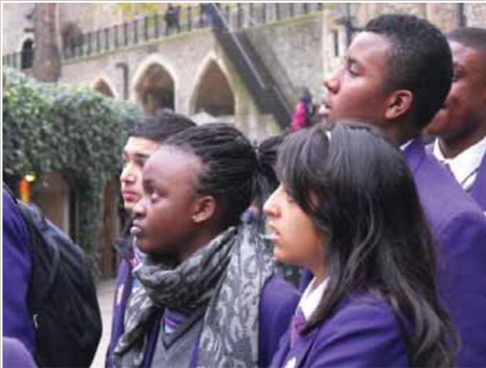
Students involved in Represent London Projects