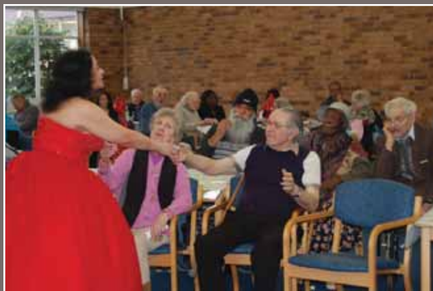
Transformers Project: Connaught Opera