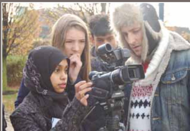
Students involved in Represent London Projects