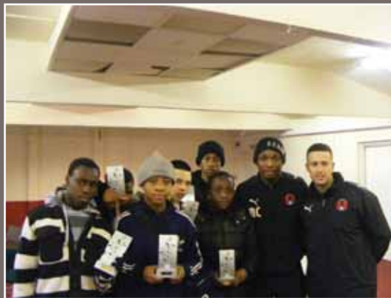
Transformers Project: Leyton Orient Football Ground