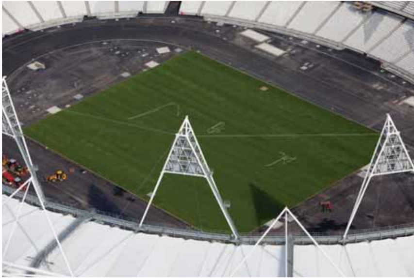
Olympic Stadium March 2011