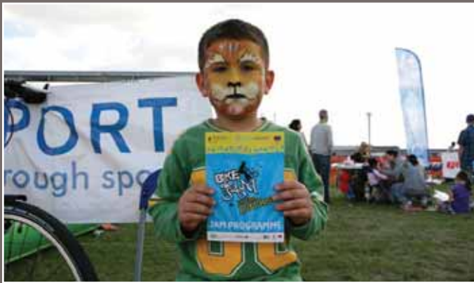
In the Parks - Bikejam