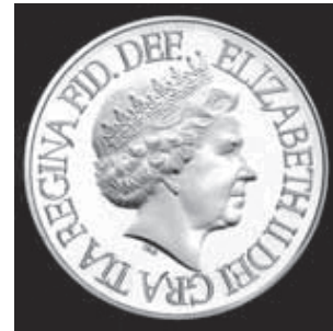
Obverse (Actual Size)