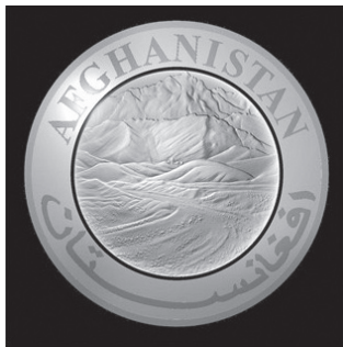
Reverse (Actual Size)