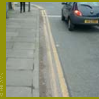
Grade C Widespread distribution of detritus with minor accumulations