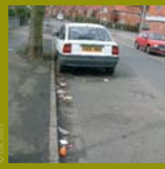
Grade C Widespread distribution of litter and/or refuse with minor accumulations