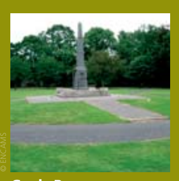
Grade B Predominately free of litter and refuse apart from some small items