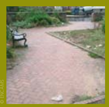
Grade C Widespread distribution of litter and/or refuse with minor accumulations