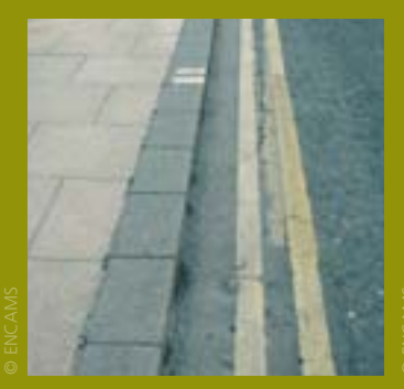
Grade A No detritus