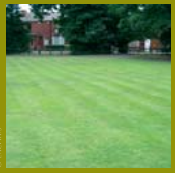
Grade A No litter or refuse