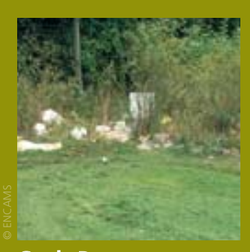
Grade D Heavily affected by litter and/or refuse with significant accumulations