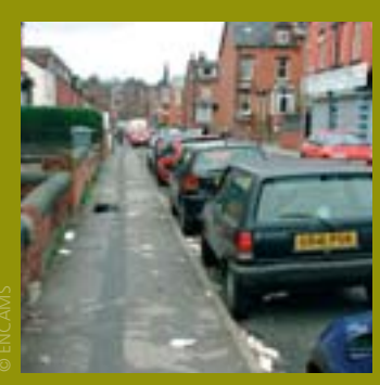
Grade D Heavily affected by litter and/or refuse with significant accumulations