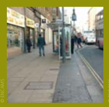
Grade B Predominately free of litter and refuse apart from some small items