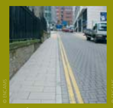
Grade A No litter or refuse