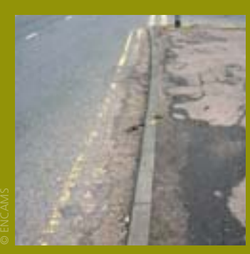
Grade D Heavily affected by detritus with significant accumulations