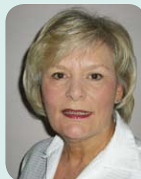
Sue Gregory Deputy Chief Dental Officer for England

To read the guidance in full, see: http://www.dh.gov.uk/en/Publicationsandstatistics/Publications/PublicationsPolicyAndGuidance/DH_121386