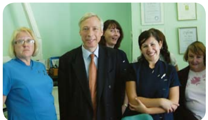
Lord Howe with members of the Cambridge Oasis dental team

'We were very pleased to have the opportunity to meet Earl Howe and to be able to talk to him about the dentistry services that we offer local people in Cambridgeshire. In particular it gave us the opportunity to discuss the work we are doing to improve the patient experience by focusing on preventative treatments and the importance of good oral health.'