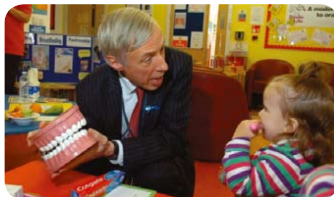
Lord Howe's visit to Chorley

On 27 October, Health Minister Lord Howe launched the innovative Smile4Life programme in Chorley, Lancashire, designed to promote good oral health among pre-school children in the region.