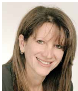
Rt Hon Theresa May MP Home Secretary and Minister for Women and Equalities

A handwritten signature in black ink, appearing to read 'Lynne Featherstone'.